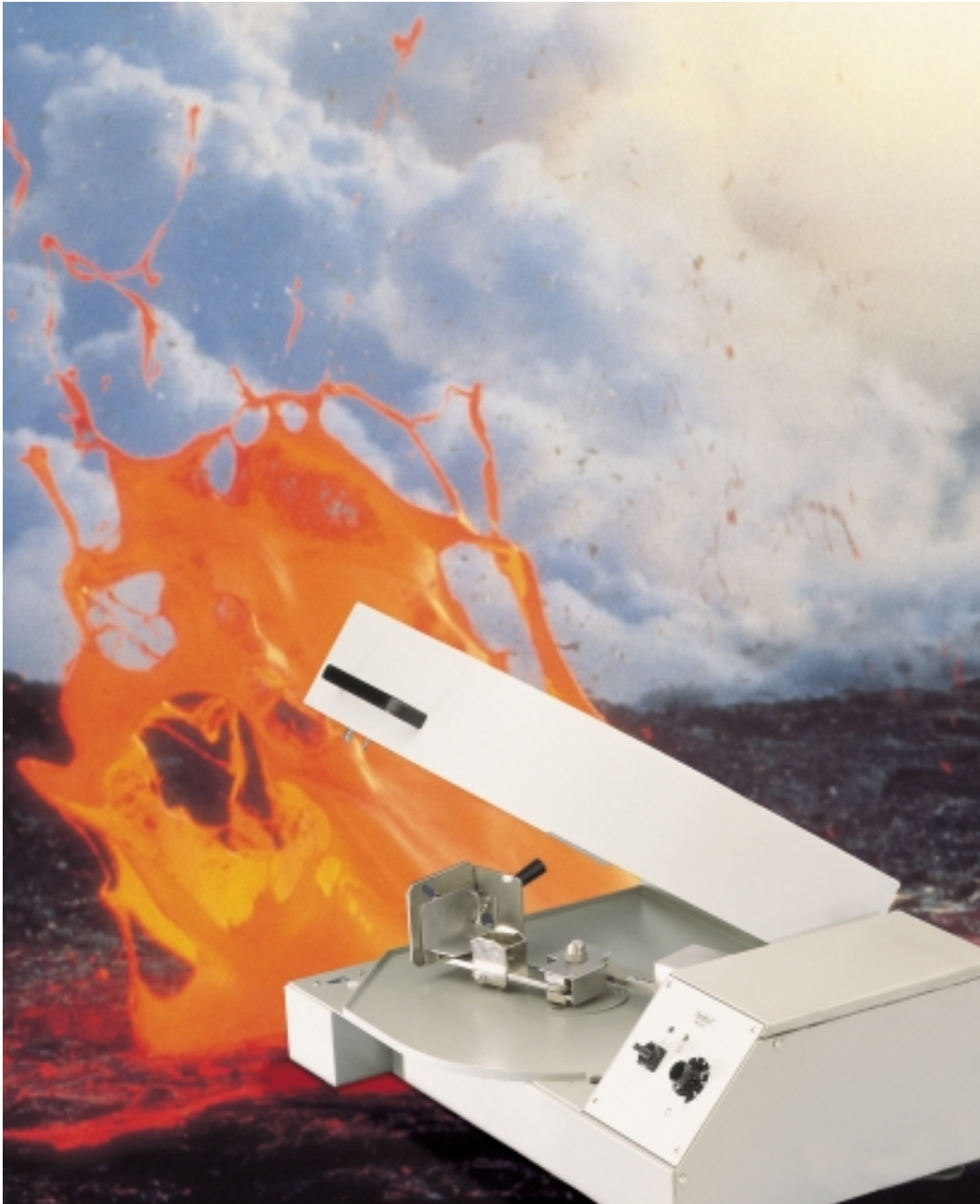
Fundor T – Benchtop casting machine for flame-melting